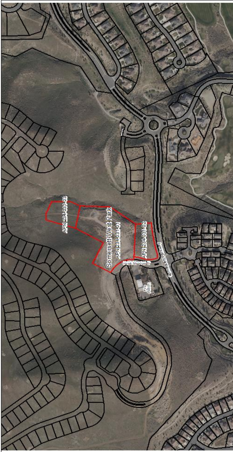
Exhibit B Project Area Map