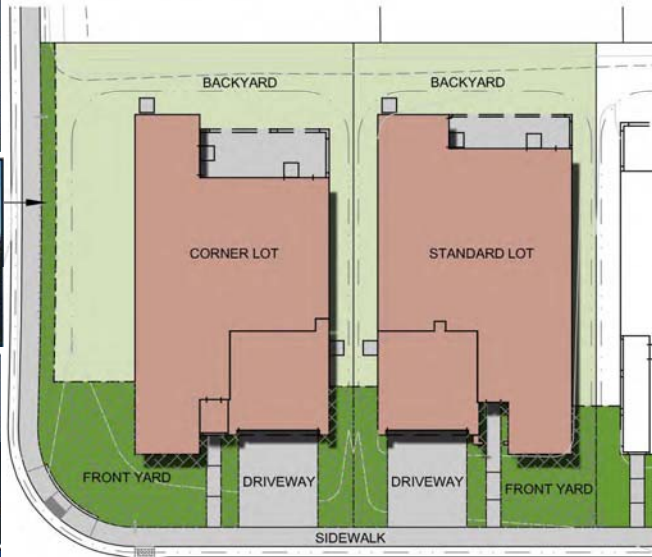
CONCEPTUAL LOT LAYOUT